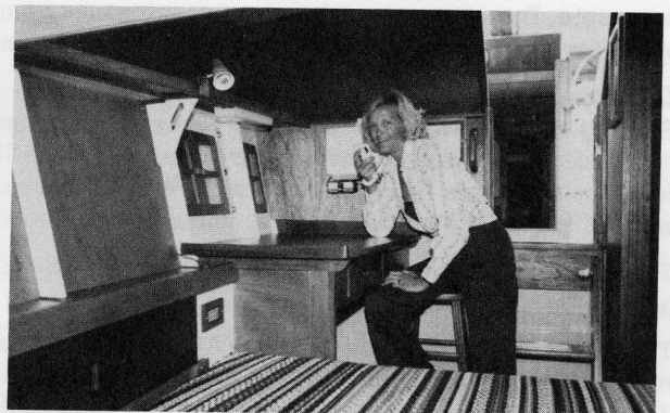
DOUBLE AFT CABIN VIEW FORWARD