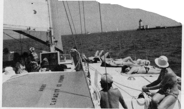
UNCLUTTERED DECK SPACE FOR LOUNGING AND EASY SAIL HANDLING