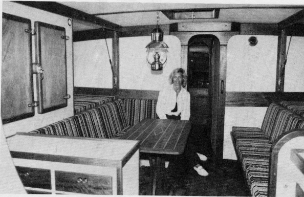
SPACIOUS MAIN COMPARTMENT SHOWER FWD OF BULKHEAD PORT / HEAD STB'D.