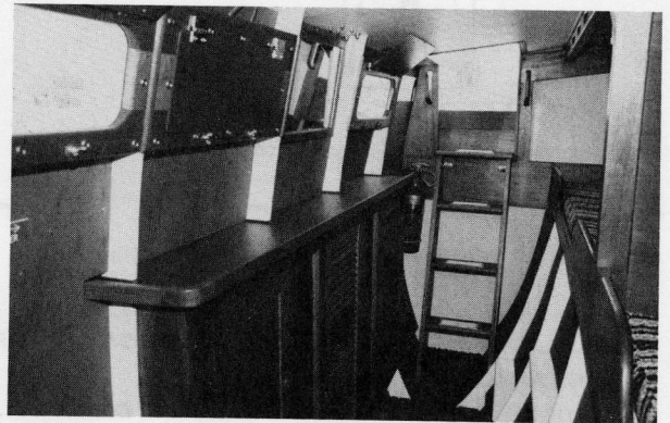
AMA VIEW AFT – HEAD IN AMA SHOWER OPTIONAL