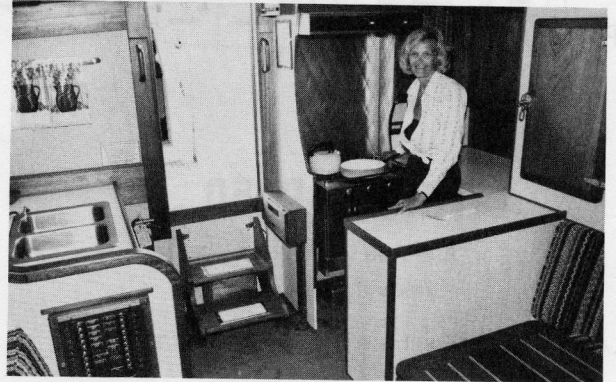
GALLEY SPACIOUS, FULLY EQUIPPED