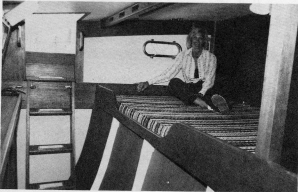
AMA STATEROOM – 2 QUEEN SIZE BERTHS NOTE HEAD ROOM